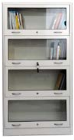
Model-VBC Book Shelf Size: 33" x 12"x 66"