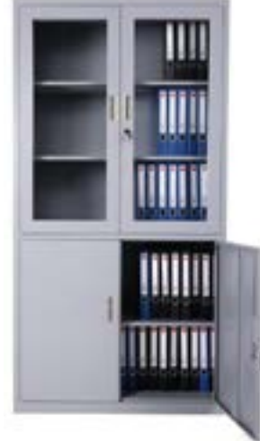
Model- VGD-3 Glass Door cupboard Size: 36" x 18"x 72"