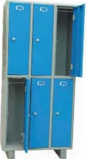
Model- VIL-6 Individual Locker Cabinet Size: 36" x 18"x 78"