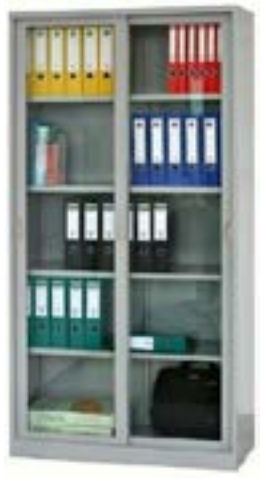
Model- VGD-2 Glass Door cupboard Size: 36" x 18"x 72"