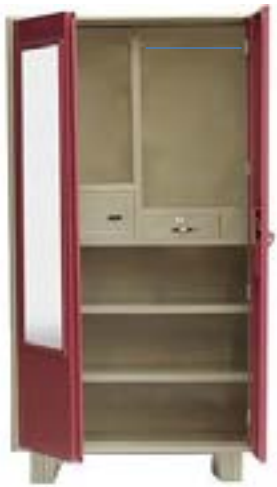
Model- VCB-03 Storage cupboard-Locker & Hanger- Size: 36" x 18"x 78"