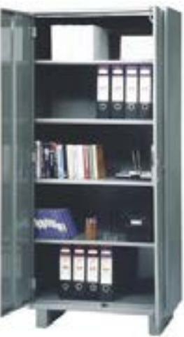
Model- VCB-01 Storage cupboard- Plain Size: 36" x 18"x 78"