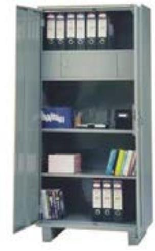
Model- VCB-02 Storage cupboard-Locker Size: 36" x 18"x 78"