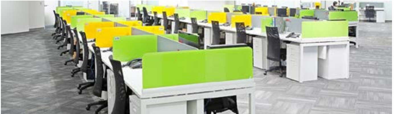
DESK BASED WORK STATION- LINIER STANDARD SPECIFICATION

Desks are modular in nature and can be configured single and converted into many. It has options to be converted into office desks, computer desks, conference tables, counters, etc. The office desks have an option of discussion tables and for work-tables there is also an option of desk based partition