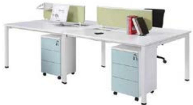
DESK BASED WORK STATION- CLUSTER STANDARD SPECIFICATION

Frame : 50mm x 50mm , CRCA Powder Coated - U Shape Leg Privacy Screen : Lacquered Glass - 5mm + 5mm Raceway : M.S Powder Coated Box Provision below Worktop Work Top : 25mm Thick - 2mm PVC Edge Banding Tape , Having Wire Manager Provision Back To Back (Sharing) Drawers : Three Drawer Unit with Central Lock Linear ( Non Sharing ) Key-Board Tray : Optional C.P.U Trolley : Optional Size Per Seat : 1500mm (L) x 1500mm (W) x 750mm (H) Partition Height : 400mm